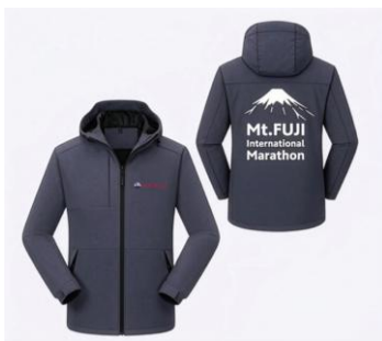
Original Wind Jacket (Grey)