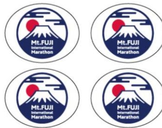
Number Card Holder