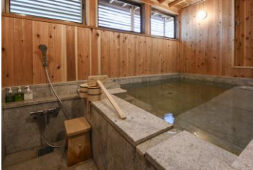
Half Open-air Private Bath