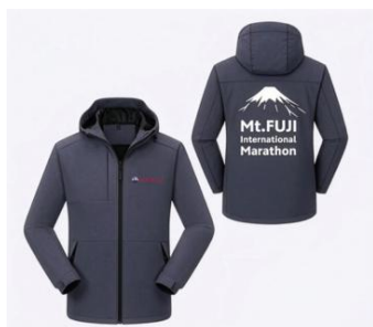
Original Wind Jacket (Grey)